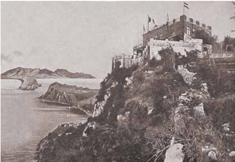
Hotel Caesar Augustus “Villa Bitter” circa 1901