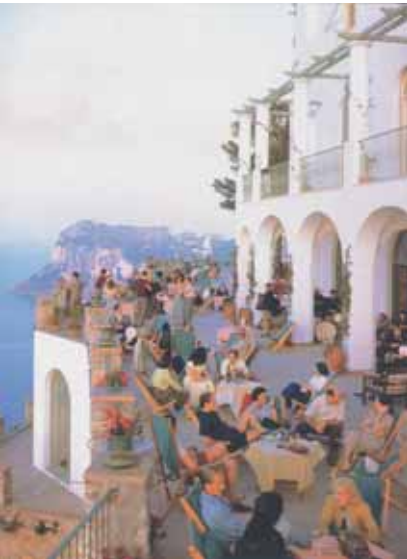
Hotel Caesar Augustus “La Terrazza” 1949

Oggi l’albergo, completamente rinnovato in totale armonia con la sua storia e con la sua speciale atmosfera, perpetua la leggenda incantata di questo sito millenario.